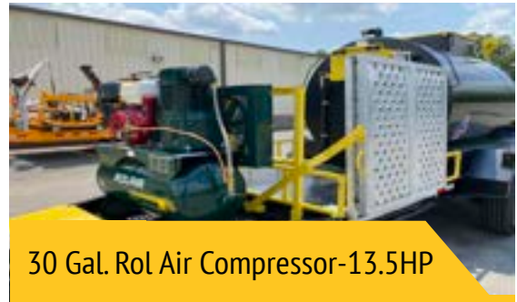
30 Gal. Rol Air Compressor-13.5HP