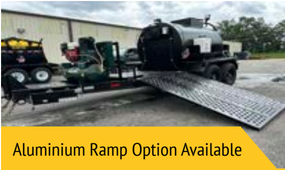
Aluminium Ramp Option Available