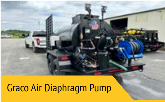
Graco Air Diaphragm Pump